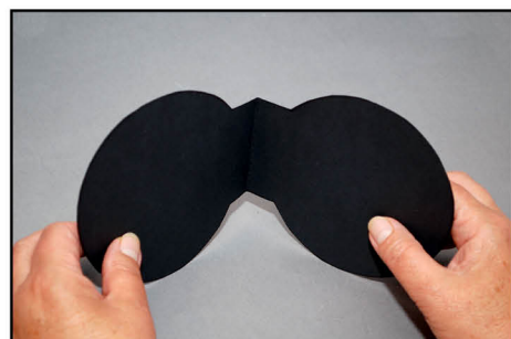
STEP 4: FOLD TEMPLATE 2 ALONG DOTTED LINE