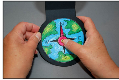
STEP 6: PIN COMPASS NEEDLE THROUGH THE MARKED DOT ONTO THE MIDDLE OF THE WORLD