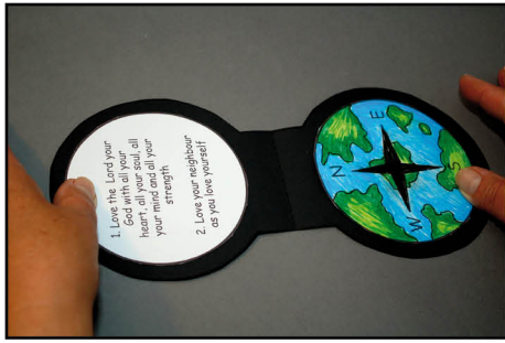
STEP 5: STICK COMPASS AND GLOBE ON EACH SIDE OF THE CIRCLE