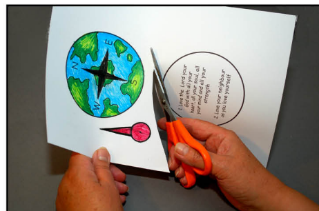
STEP 2: CUT OUT TEMPLATE 1