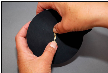
STEP 7: OPEN SPLIT PIN ON THE BACK OF THE TEMPLATE