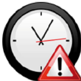
FOR A SHORTER SESSION: PREPARE STEP 2 AND 3

JESUS GAVE US THESE COMMANDMENTS TO LOVE GOD AND LOVE OTHERS, TO SHOW US GOD'S WILL AND SHOW US WHAT TO DO AND GUIDE US IN OUR LIVES, LIKE A COMPASS