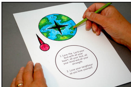
STEP 1: COLOUR IN TEMPLATE 1