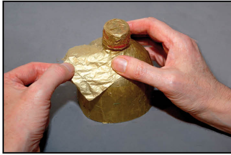
STEP 5: COVER THE BOTTLE HEAD IN GOLD TISSUE PAPER