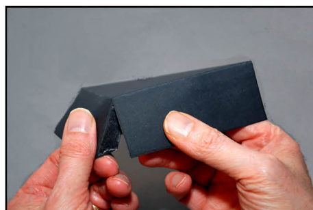
STEP 2: FOLD TEMPLATE ALONG DOTTED LINES AND MAKE IT INTO A BOX, STICKING IT TOGETHER USING THE TABS