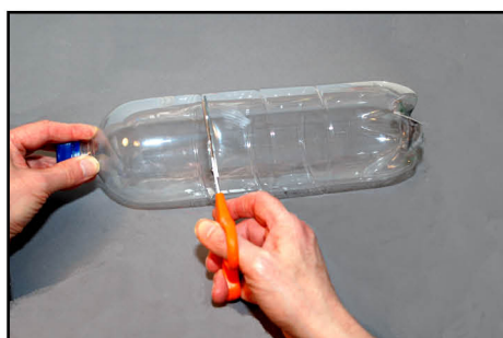
STEP 3: CUT THE HEAD OF THE BOTTLE