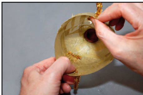
STEP 9: FOLD THE ENDS OF THE PIPE CLEANERS INSIDE THE