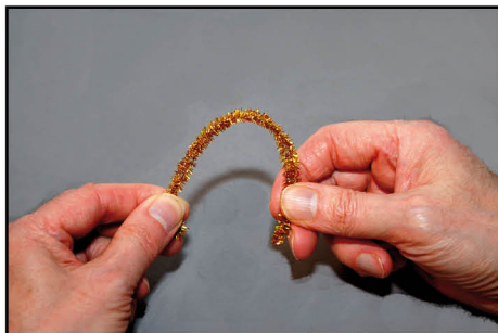
STEP 7: CURVE PIPE CLEANERS INTO AN ARCH