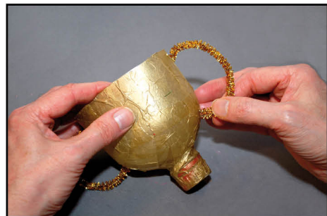
STEP 8: THREAD EACH END OF THE PIPE CLEANERS INTO THE HOLES ON EACH SIDE OF THE BOTTLE