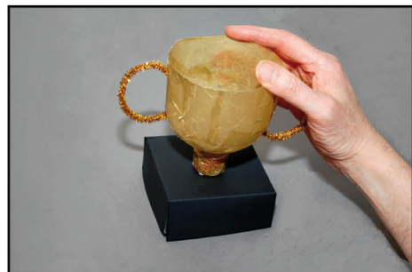
STEP 10: STICK THE BOTTLE TOP ONTO THE FOLDED TEMPLATE