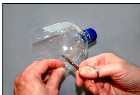
STEP 4: MAKE 2 HOLES IN OPPOSITE SIDES OF THE BOTTLE